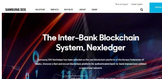
Samsung SDS website powered by ICS

We've trained marketers of each office on how to use ICS to enable them to edit pages and reflect the update to the website right away and in the end, we could minimize miscommunication cases and reduce personnel expenses as we no longer needed to get HQ people involved to the work.